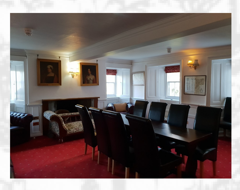
The Long Room